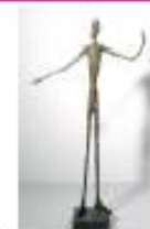
Man Pointing, 1947

Surrealism – Art about dreams, fantasies and unreal things.