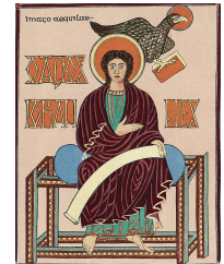
St John the Apostle