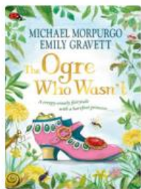
The Ogre Who Wasn't Michael Morpurgo

Finally, here are a few book recommendations you might like to explore with your child at home: