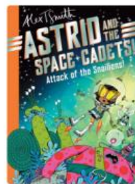
Attack of the Snaliens! Alex T Smith