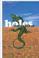
Holes Louis Sachar